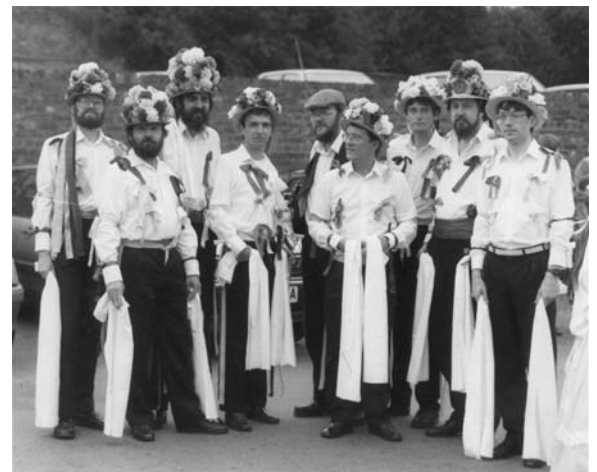
Lymm Revival Team at the 1986 Rushbearing Ceremony