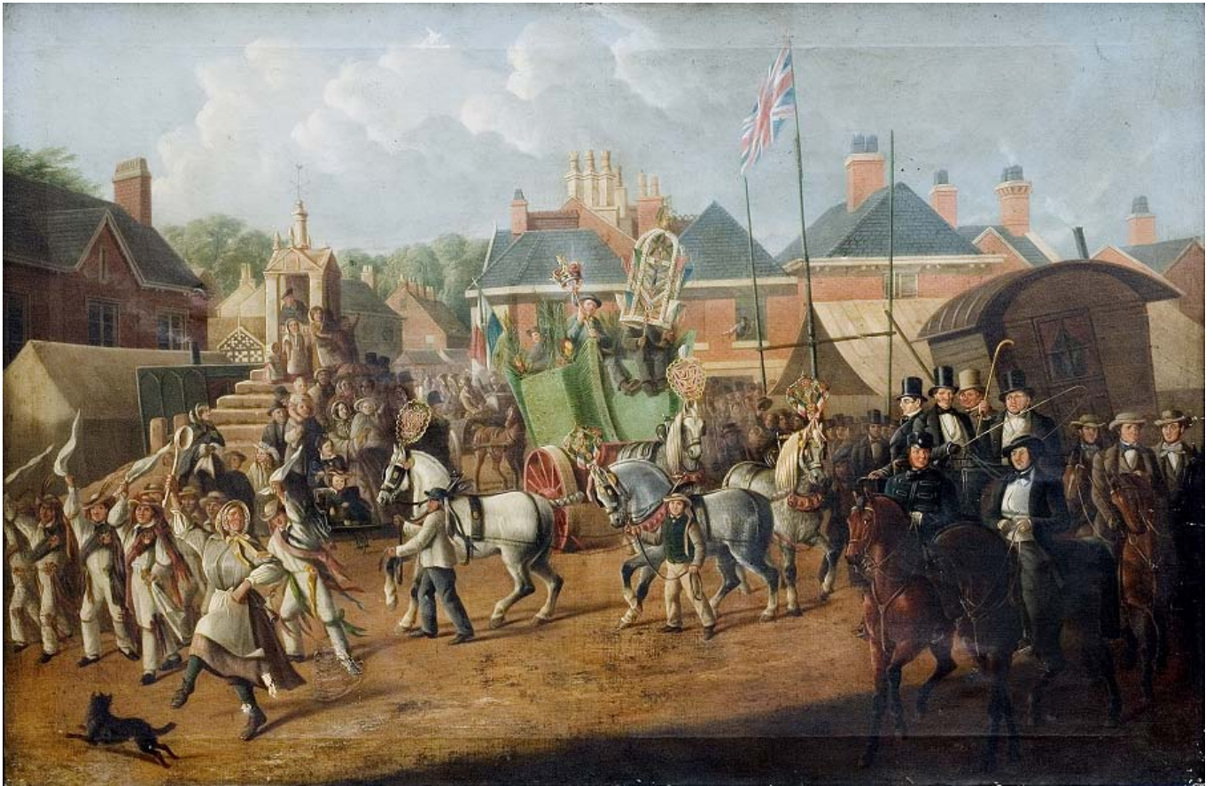
The earliest known illustration is a 1840 oleograph of Lymm Rushbearing