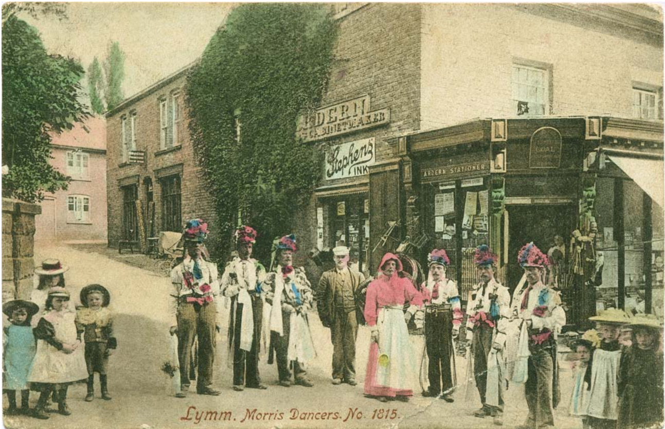
The 1904 Lymm Morris Dancers at Henry Street 3 , Lymm