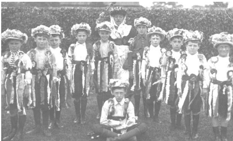
The Statham Boys Team at the 1923 May Queen