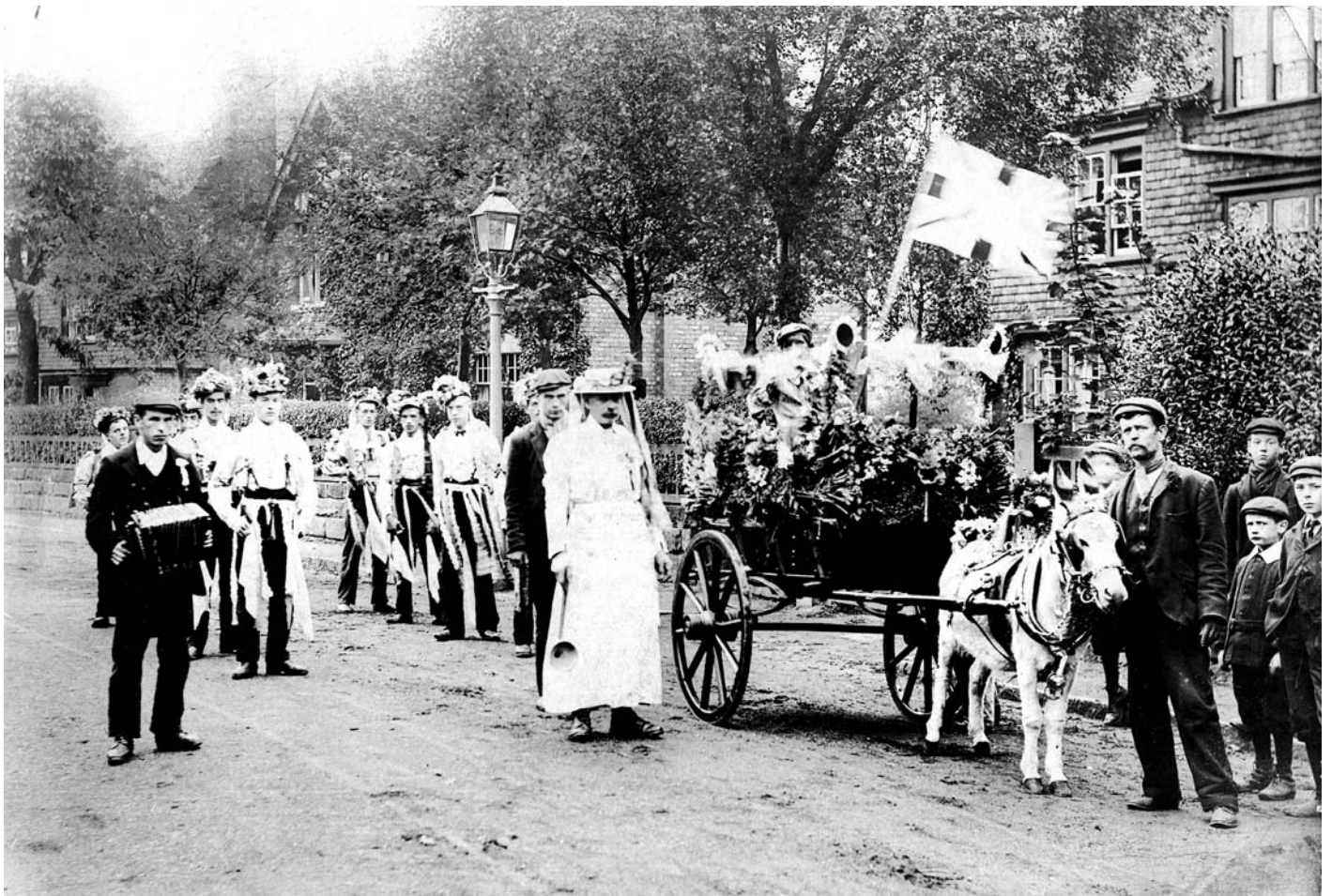
The Rushcart with Lymm Morris Dancers in Maltmans Road, Lymm