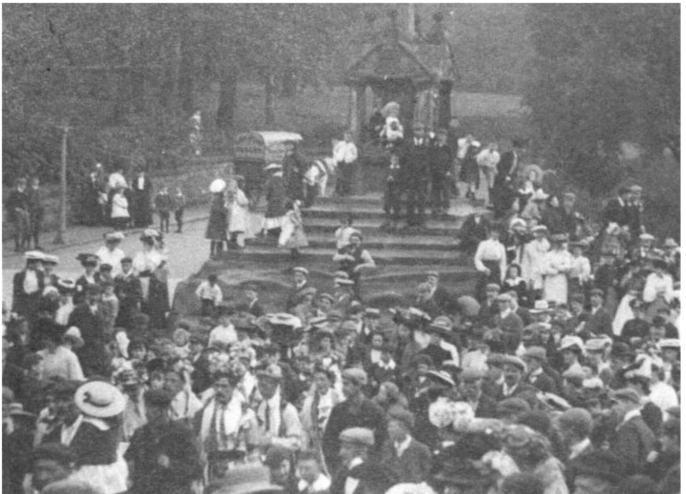
The 1907 Lymm Rushbearing at Lymm Cross in the village centre (detail from a postcard of the event)

Other undated postcards / photographs have been discovered. Some dancers are clearly common to these photographs taken around 1907 - 1910