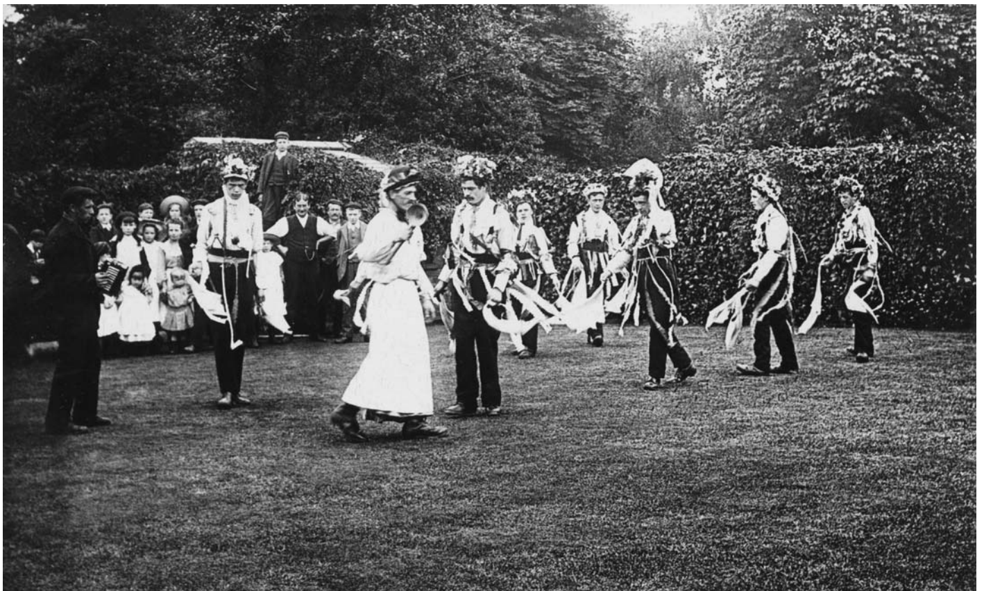
Lymm Morris Men - Location unknown

Other undated postcards / photographs have been discovered. Some dancers are clearly common to these photographs taken around 1907 - 1910