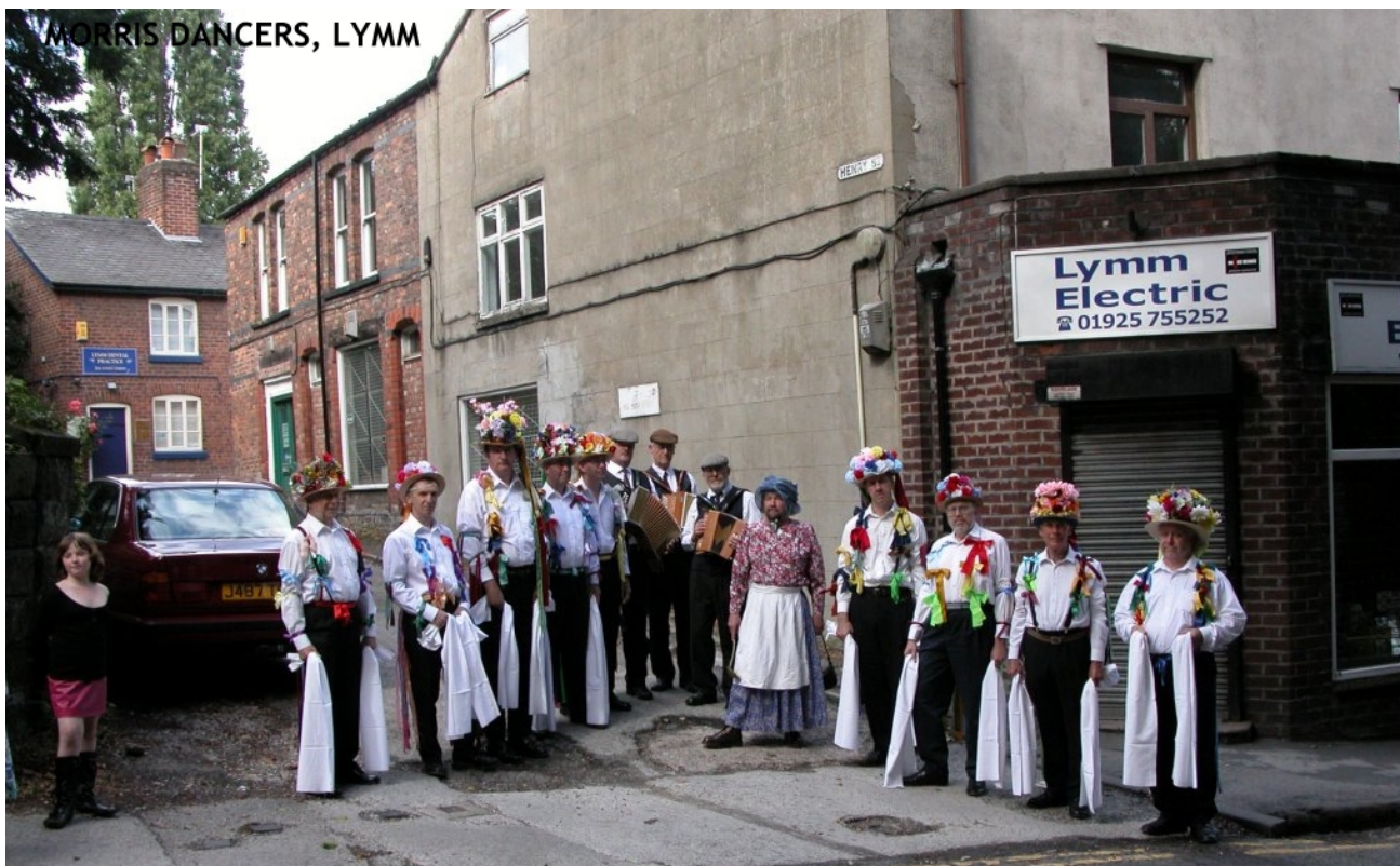
The 2005 Lymm Team at Henry Street, Lymm

More information can be found at the Lymm Morris Dancers Archive: www.lymm-morris.org.uk