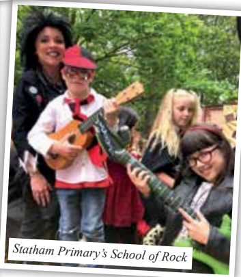
Statham Primary's School of Rock