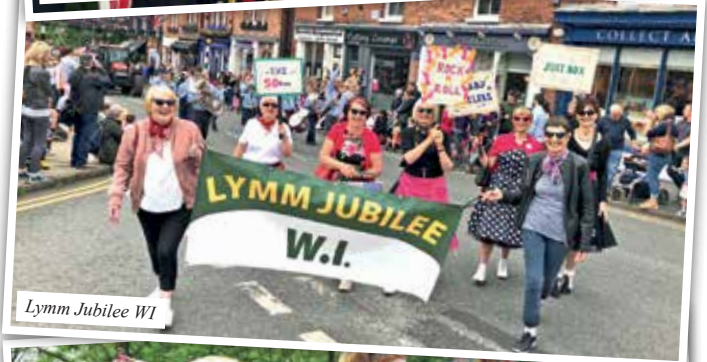
Lymm Jubilee WI