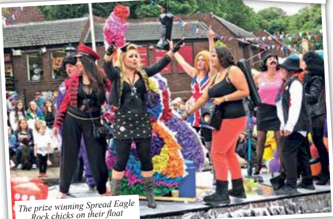
The prize winning Spread Eagle Rock chicks on their float