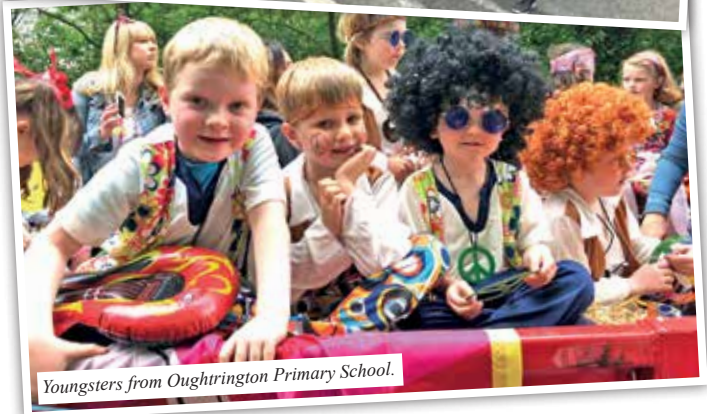
Youngsters from Oughtrington Primary School.