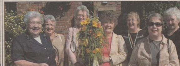
Residents carry their rushes in the sunshine