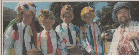
Lymm Morris Dancers add some colour to the event

Get 10% off all Rushbearing photographs online by going to: warringtonguardian.co.uk and clicking on 'buy a photo'