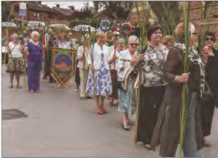
Procession leaves Pepper Street.