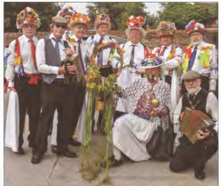
Lymm Morris Men group.