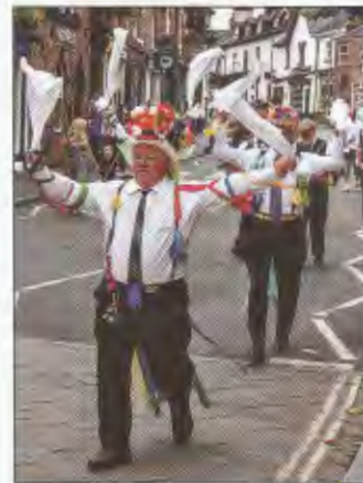
Lymm Morris Men dancing in the procession.