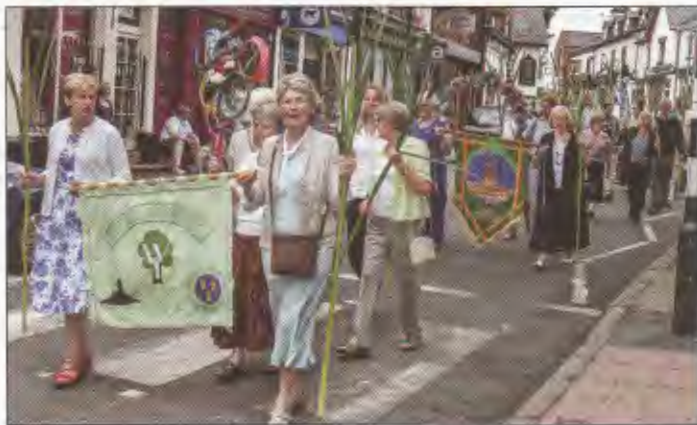
Lymm Jubilee Wî & Lymm Wî in Procession.